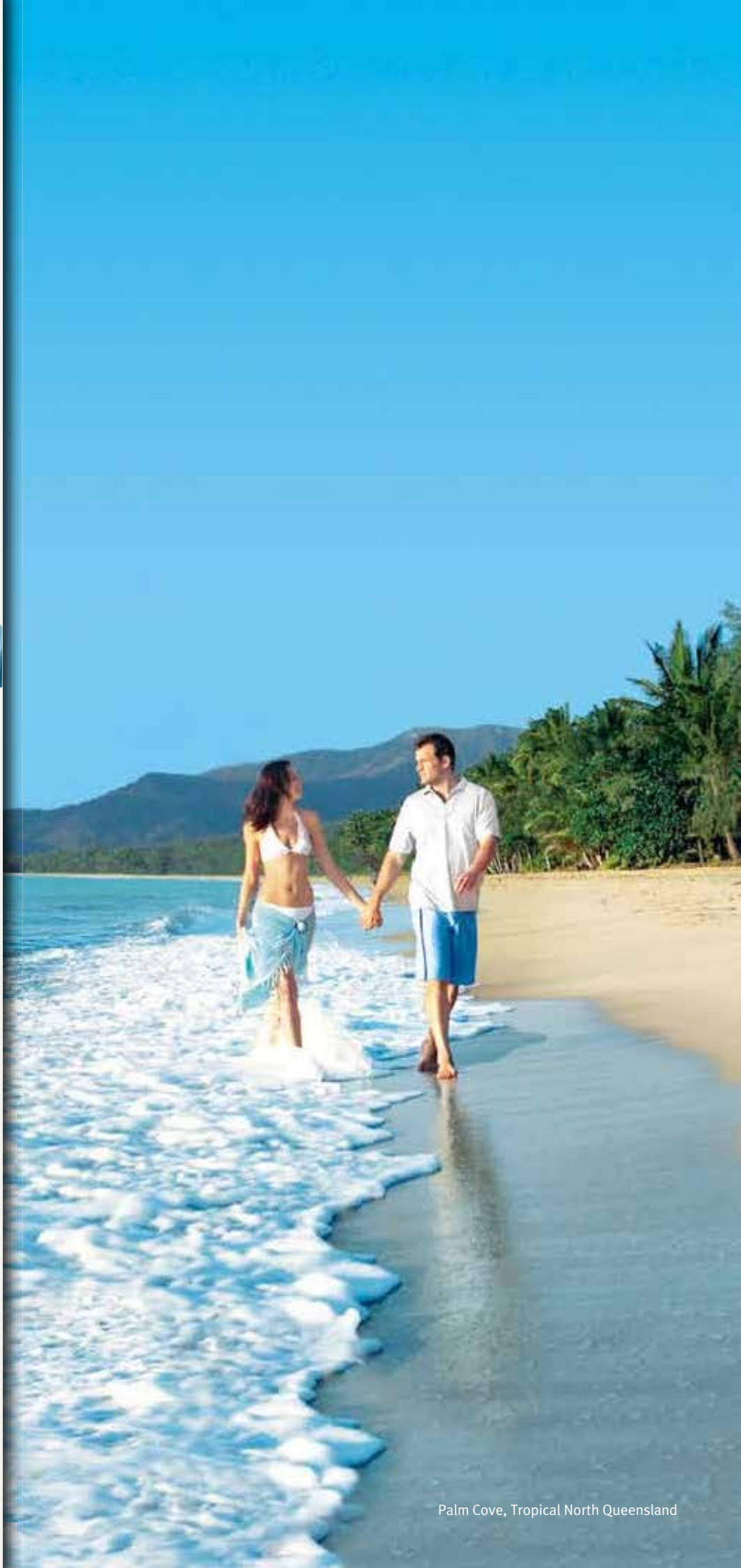
Palm Cove, Tropical North Queensland