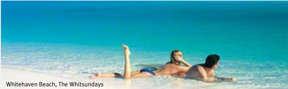
Whitehaven Beach, The Whitsundays

Escape, discover and indulge in some of the most romantic settings and perfect wedding locations in Australia, New Zealand and the South Pacific.