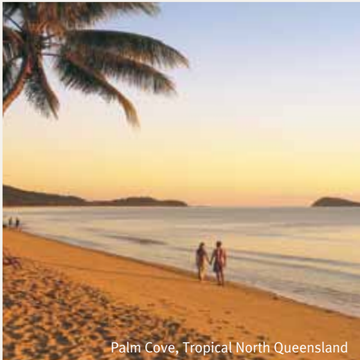
Palm Cove, Tropical North Queensland